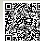
SCAN THE QR CODE TO LINK TO GRUNDFOS PRODUCT CENTER